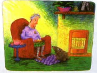
WRITTEN BY MCIII FOX ALLOSTRATED BY TETTY Denion