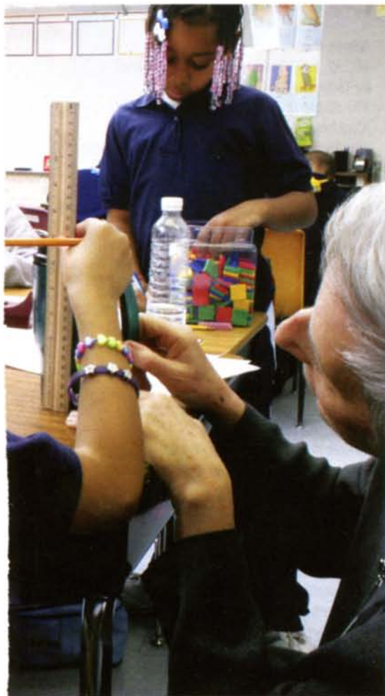
LEFT: Leo Lionni's Inch by Inch is an ideal choice for combining literacy and hands-on learning.