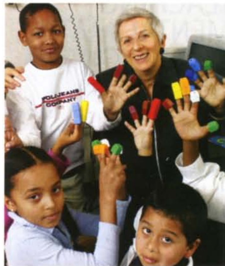
LEFT: I begin the read aloud by asking the children to judge the book by its cover.

Lastly, I gave the children an independent assignment. Each child chose one of the number sentences from the chart, copied it, and illustrated it. “You can draw ducklings or any other shapes,” I told them. The result: artful number sentences from ducks to diamonds! Children ready to take on an additional challenge also wrote and illustrated their own equations, with combinations of more than two numbers that added up to seven.